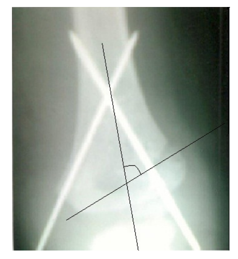
Fig-3: Intraoperative assessment of Baumann's angle

The patient was observed for a period of 24 hours and was followed at 1 week. 3-4 week. 3 months and 6 months. Carrying angle and Baumann's angle and movements of elbow were assessed at each follow-up. Another set of radiographs were taken when the elbow attained full extension. An improvised used instrument goniometer is for measurement of carrying angle. Bicipital groove, biceps brachii tendon at its insertion and palmaris longus tendon at the wrist were palpated and marked as anatomical landmarks to demarcate the median axes of the arm and the forearm respectively for carrying angle assessment.